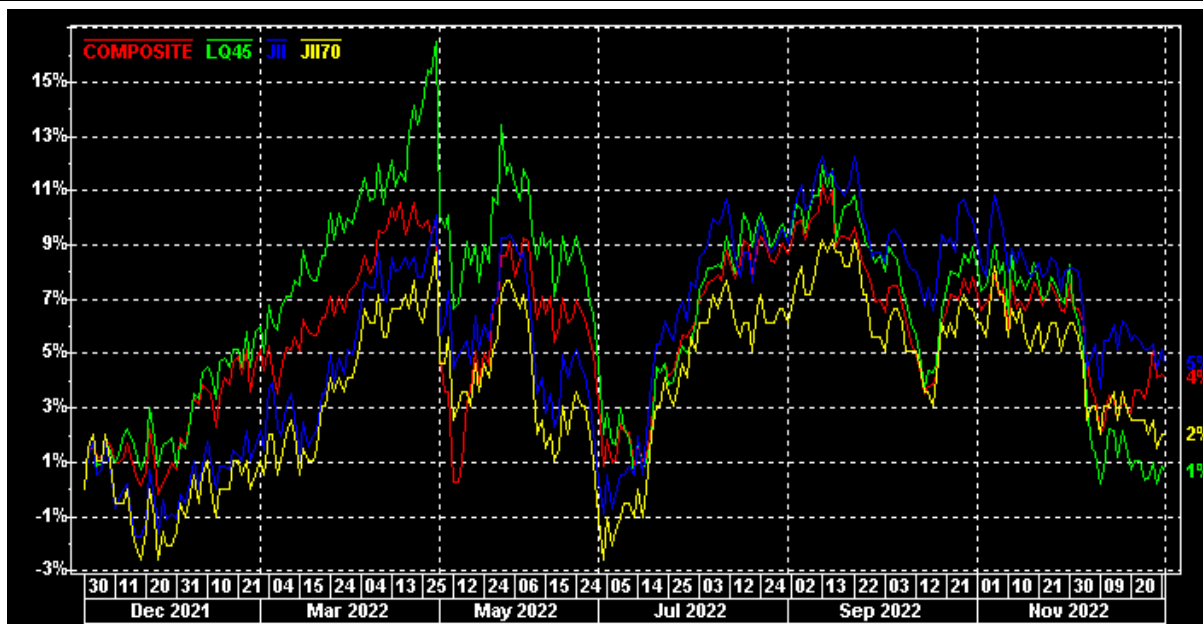
Chart 1: Composite, LQ45, Jakarta Islamic Index (JII), and JII70